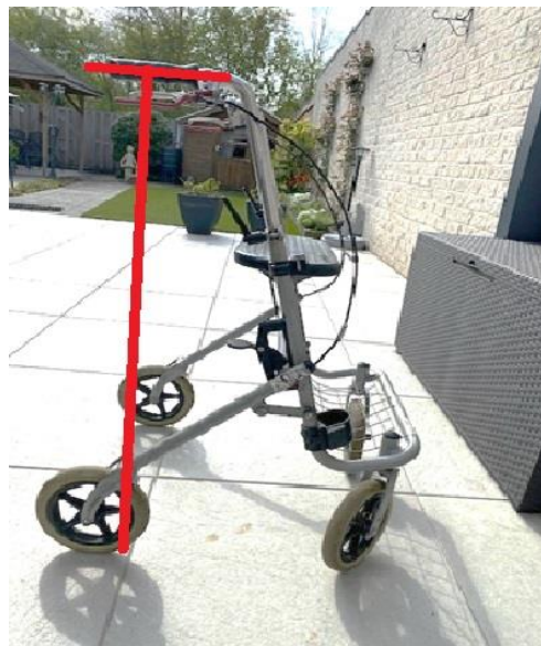
Photo 1: Wikipedia [11]: A walker (North American English) or walking frame (British English) is a device that gives support to maintain balance or stability while walking, most commonly due to age-related mobility disability, including frailty. Another common equivalent term for a walker is a Zimmer (frame), a genericized trademark from Zimmer Biomet, a major manufacturer of such devices and joint replacement parts. Walking frames have two front wheels, and there are also wheeled walkers available having three or four wheels, also known as rollators.

This pathological tone will decrease when people create an greater support area and have more control over their balance but this asked from all therapist that there is an good assessment why this extra aid is important and thus also knowledge which walking aid, but also the control, how this developed, is important so that people can hold their independency as long as possible.