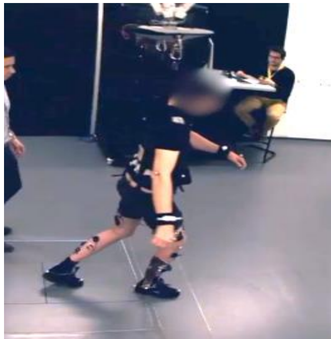
Figure 12: The same person is an apparatus that decrease the weight and of course determinate the fear of falling. That is visible because he feel the possibilities and he use this immediately. In his whole body are more degrees of freedom in the joint visible and also in the joint of the legs. Compare the knee joint, now is there flexion in both and previous say we only the knee in extension. He use also the arm swing for an better swing -and stand phase and he had an much higher speed. This effect of this decrease of gravity let see that the possibilities are much greater. For people with an spinal cord are the result promising.[43]

This searching for better solutions to move freer and faster, are signs that the environment is an positive element in this task specific situation but this is de base, now be sure that muscle pattern are increasing in power and coordination, there where you want and that asked an treatment according the training rules.