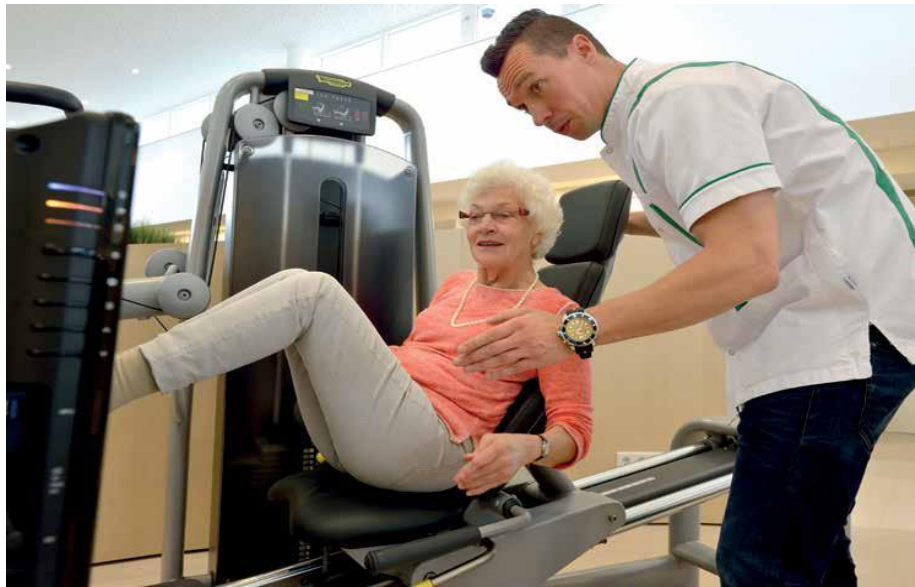
Figure 2: “Isolated” but still an exercise with more action than only in the upper leg extension muscles.

To push the weight away is not only an power in the extensors of the knee necessary but also the extensors in the hip and that asked for an action in the whole trunk (front and back) to give the muscles of the hip/leg an good anchor.[14]