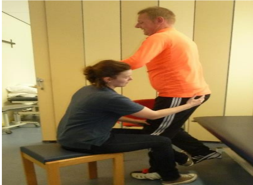
Figure 5: The assessment of 1 R.M. of hip extension of the left leg of this gentleman after an stroke about 1 year ago. His problem was that he wasn't capable to walk through and place his not-affected foot for his affected foot and that his speed was too slow. Of course, first the assessment or there were no mobility shortages in all joint, muscles and nerve tissues and that wasn't the case. There was in the affected leg an clear extension synergy but with dissociation but the tone in the muscle that are dominant is ±MAS (Modified Asworth Scale 1-2 [27] en MI (Motricity Index leg) 48/99.[28,29] The assessment of the power of the extension contraction in the hip is done by an resistance against the feet of not-affected led and it is important to get the right direction.

First the coordination will increase after that the power and this must lead to an better walking pattern with more step length and speed.