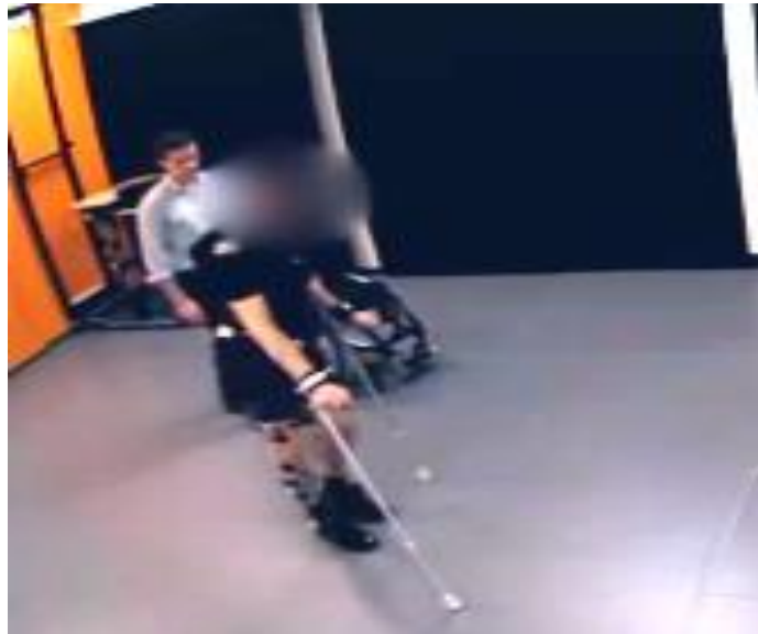
Figure 11: An person with an partial spinal cord paresis is walking with two elbow crutches. This support is necessary to control his balance and weight and make the variation in walking very poor. The power of the arms are now complete necessary to fill the gaps that are created through the spinal cord problem and now with the complete gravity on his body is walking pattern poor and balance is determinate through his crutches. Walking exercises on this way is an task specific resistance treatment for the arms and the upper trunk, or the legs have an benefit is an great question.